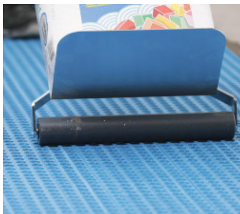
Pressing Mapeguard UM 35