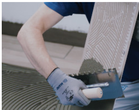
Install ceramic or stone tiles with a suitable Mapei adhesive of at least C2 class