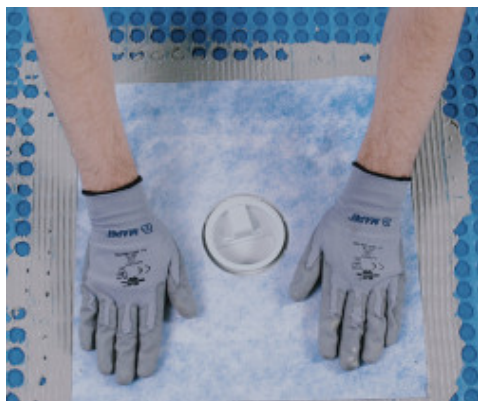
Waterproof drains with Drain Vertical/Drain Lateral