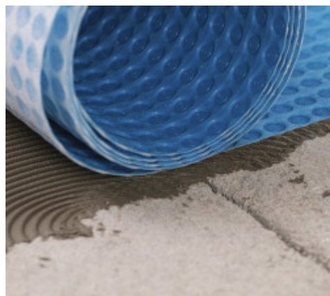
Laying of Mapeguard UM 35