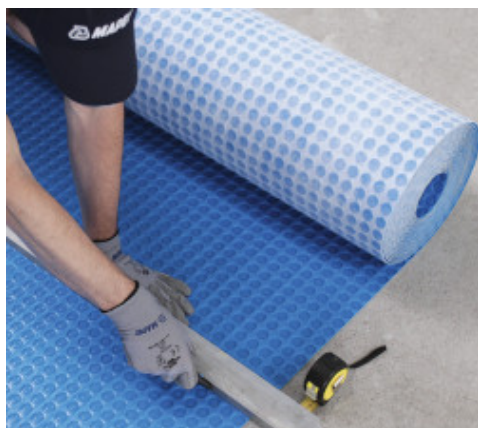
Cutting Mapeguard UM 35

To install Mapeguard UM 35 membrane correctly, we recommend consulting the Installation Manual, which is available on the company website www.mapei.com , or to contact MAPEI Technical Services.