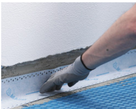
Perimetral waterproofing with Mapeband Easy, bonded with Mapeguard WP Adhesive