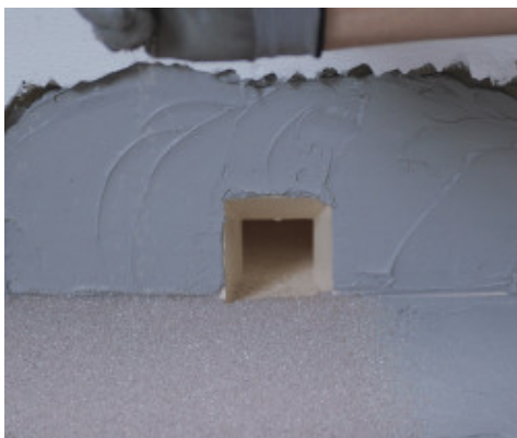
Waterproof drains with Drain Front