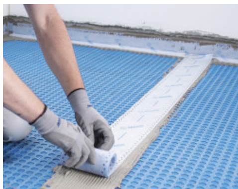
Waterproofing of joints between the sheets with Mapeband Easy, bonded with Mapeguard WP Adhesive